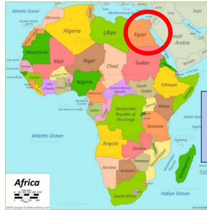
Maps showing Egypt's location

Key Question: What are the similarities between Ancient Egyptians and modern day Britain?