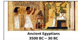
Timeline showing when Ancient Egypt was in history